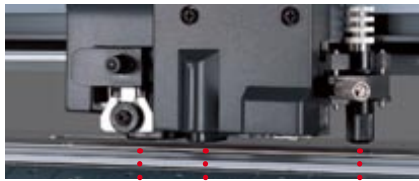
Automatic sheet Light pointer Swivel cutter

Media can be automatically cut by a standard sheet cutter.