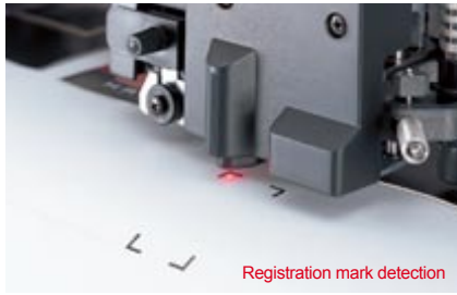
Registration mark detection